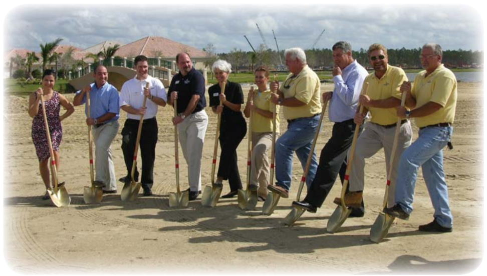
Towncenter Ground Breaking

It's all coming together, the building has begun for the ever-popular Town Center. On Tuesday, November 15, 2005 at 11:00 a.m. the Ground Breaking Ceremony took place here at Verona Walk. Light hors d'oeuvres and drinks welcomed around 150 residents to witness the first dig of what is to become the Town Center. Layout plans of the facility, samples of the furnishing, and a fine dining restaurant were revealed. Vanderbilt construction is on track to complete the town center at the end of 2006. A Fitness Center, a Lap and Resort Pool, Tennis Courts, Gas Pumps, and a Post Office are just the beginning. We are all excited about the upcoming changes and happenings that are taking place here at Verona Walk. We all are now feeling a sense of community, look for more updates to come shortly!